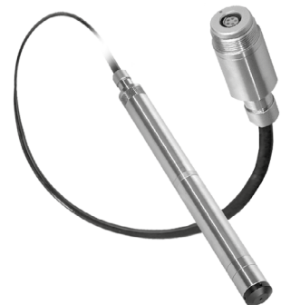
Version DCX-22SG DCX-22VG